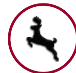
FWC Lifetime Hunting

Lifetime Boater Safety endorsement from the Florida Fish and Wildlife Conservation Commission (FWC)