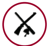
FWC Lifetime Sportsman's