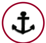
FWC Lifetime Boater